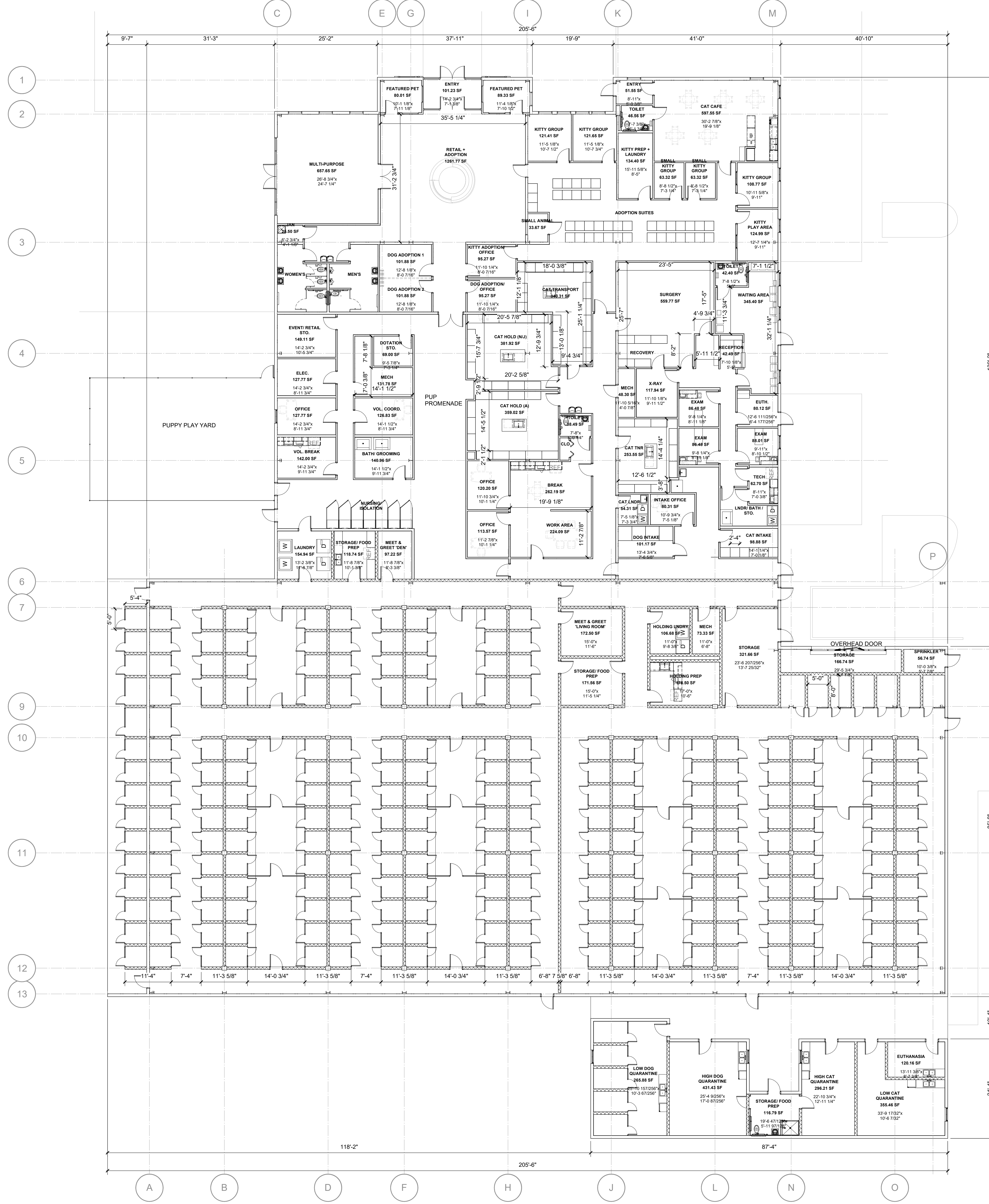
A1 OVERALL FLOOR PLAN WITH ROOM DIMENSIONS 3/32" = 1'-0"